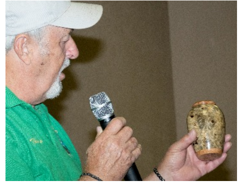
Randy Thorne, "Harvey," a vase of spalted box elder and maple burl. The natural coloring looks like a hurricane, so Randy named it after the recent one.