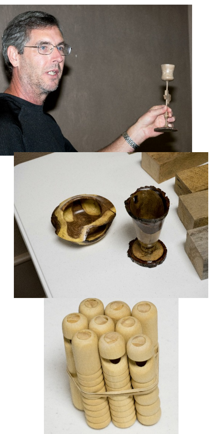
Jim donated these flutes to the Fall Festival sale.