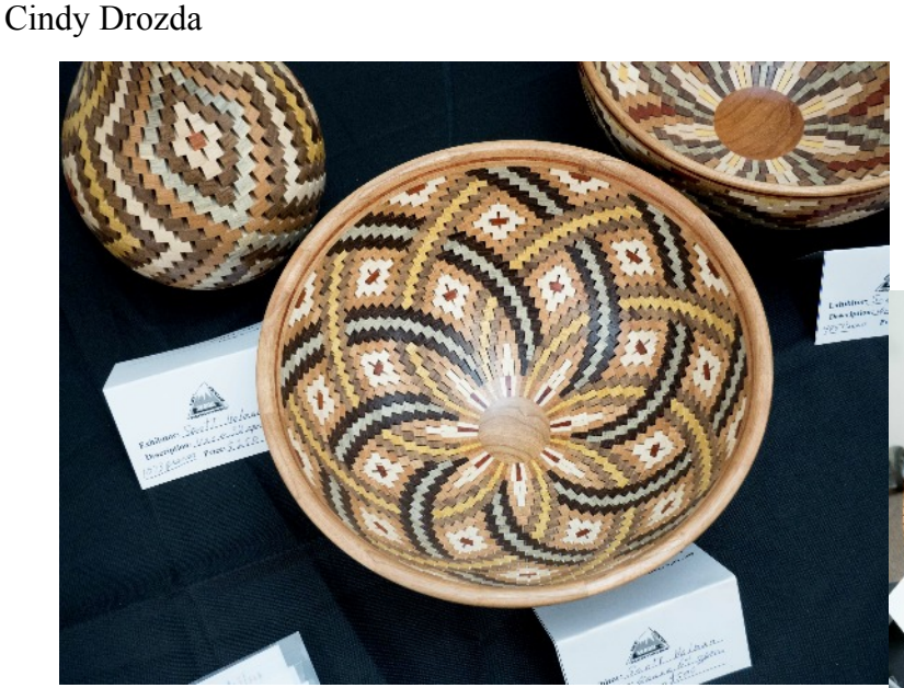
Segmented work by members of the Rocky Mountain Woodturners.