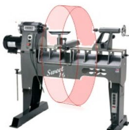
Avoid the Danger Zone When Starting Your Lathe