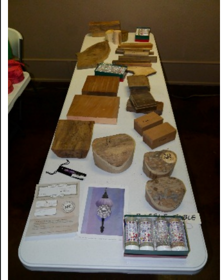
Raffle table for Nov. 4th