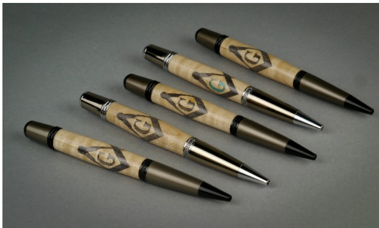
Buddy Chesser: pens inlaid with Masonic emblem.