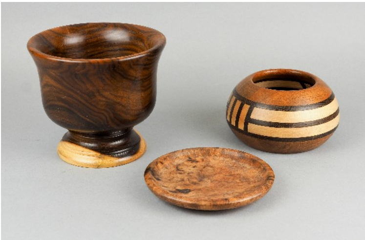
Dick Markham with turnings of assorted woods.