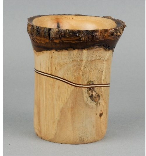
Larry Rogers, rough-edge wave bowl