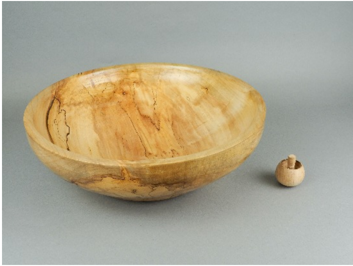
Gordon Graves, bowl of big-leaf maple, Tipee Top of maple