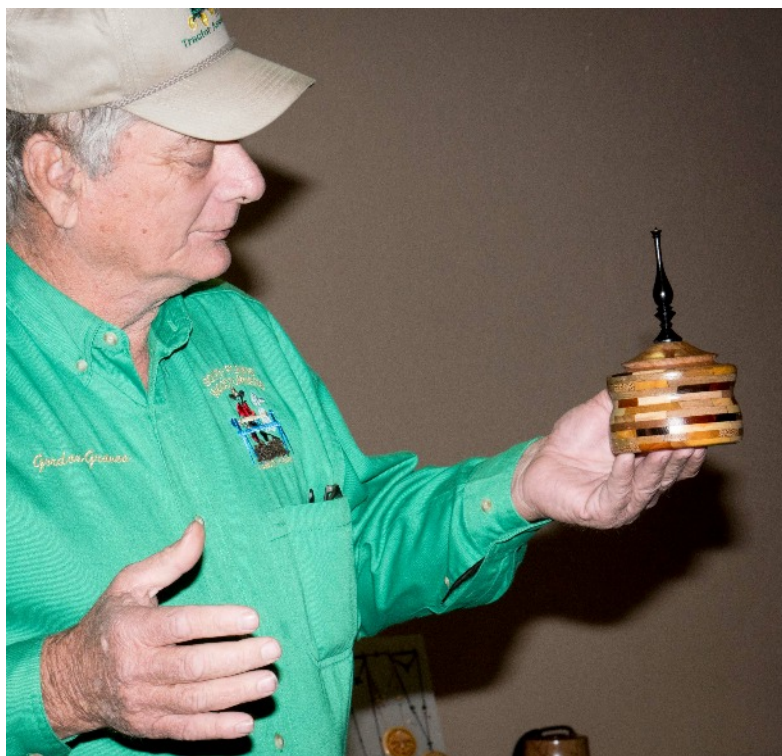
Gordon Graves: lidded segmented box with finial