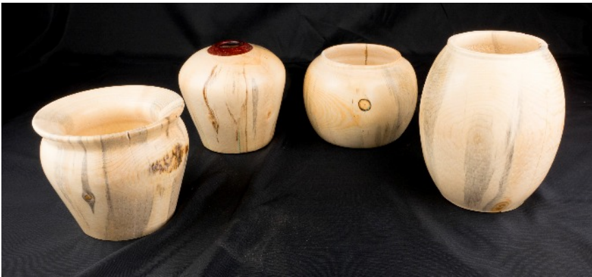
Ron Butler: vessels of lodge pole pine