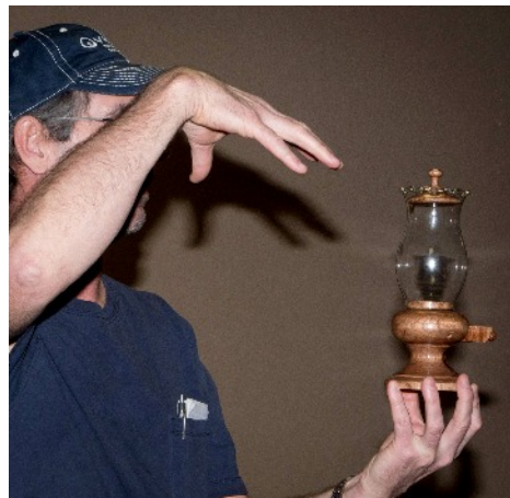
"I command thee to fill thyself with candy."