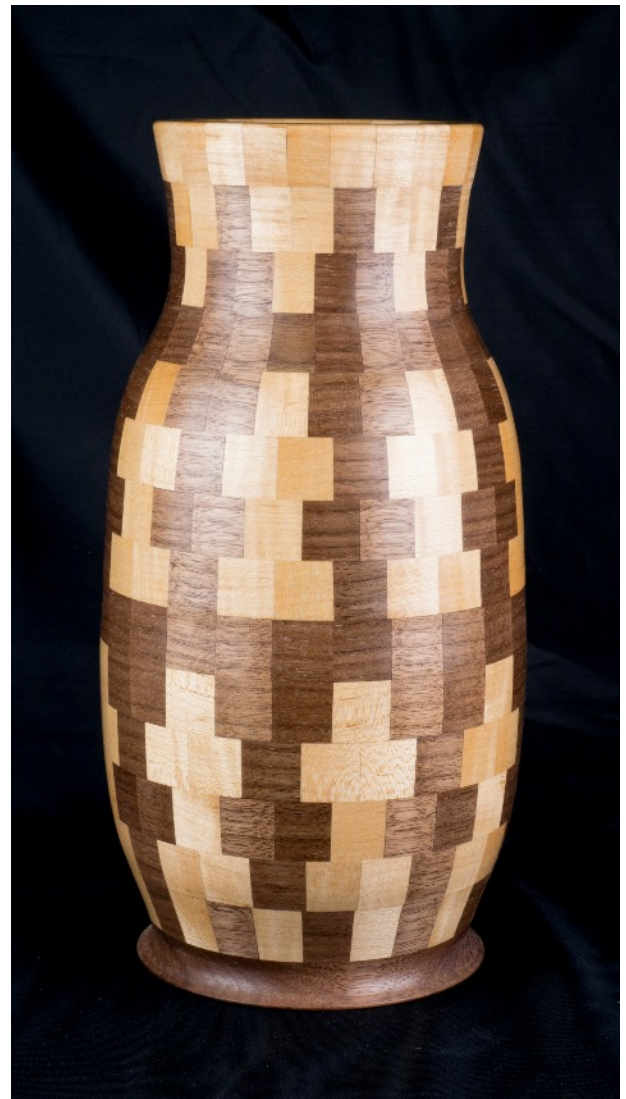
Ronald Dutton: segmented vase of walnut and maple.