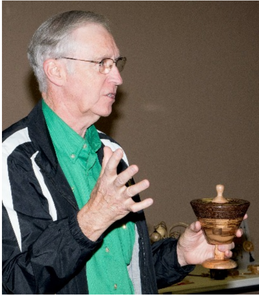
Coy Hunt: lidded vessel of wenge, zebrawood, and mystery wood.