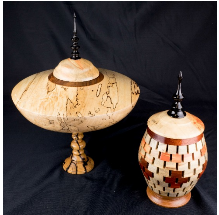
Randy Thorne: lidded bowl of spalted maple, black and white ebony, walnut box elder, with ebony finial; lidded open-segment vessel of mesquite, spalted box elder, and bloodwood; of walnut, curly maple, ambrosia maple, black veneer (far left); and (near left) staved vessel of walnut with black-dyed maple top, yellow veneer.