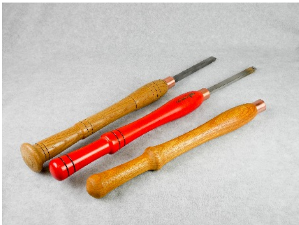
David Turner (the tool handle with no shaft is of canary wood).