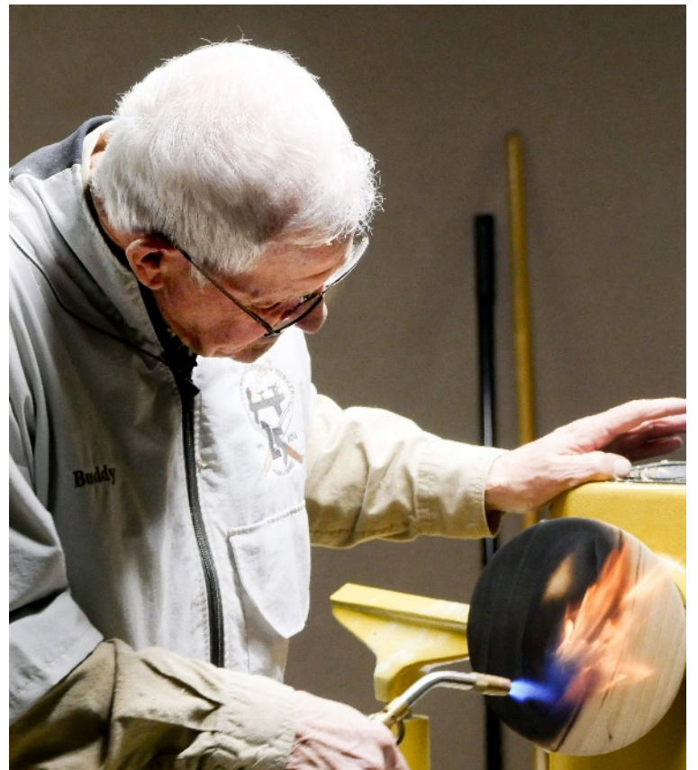
A man works up a powerful thirst making a torched ash piece with silver cream.