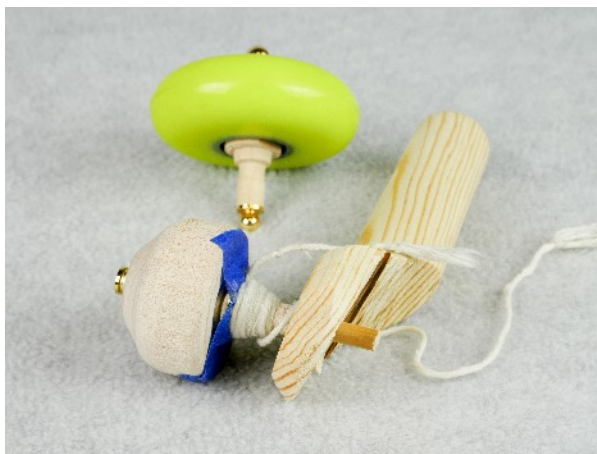
Kent Crowell: magnetic levitating tops