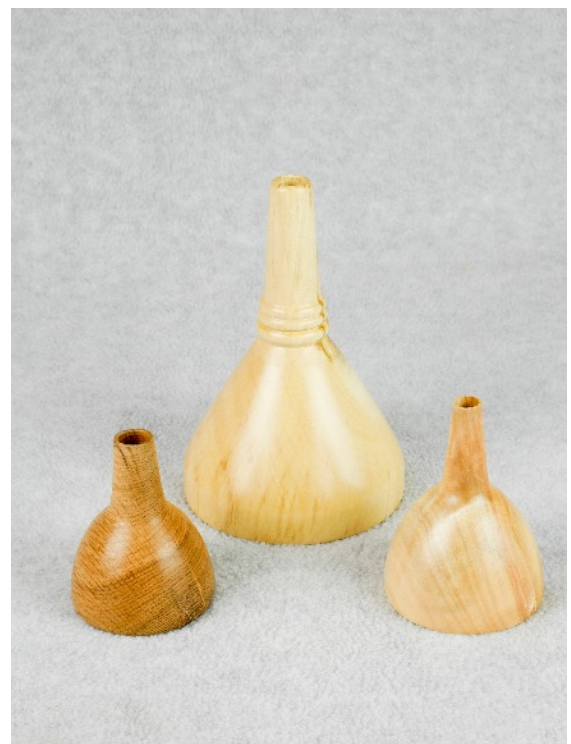
Vicki Oglesby: funnels (large one of silver maple, small one on right of white oak, small one on left is an unidentified red-headed stepchild).