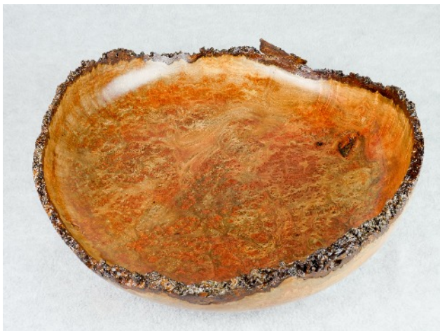
Buddy Compton: (top) "Pontiac bowl," so named because the dark area resembles an old Pontiac hood ornament (see insert); colored wall hanging of sycamore dyed with Trans-Tint; dark wall hanging of sycamore dyed first with black, then red (both wall hangings textured with a chainsaw); rough-edge bowl of cedar elm bark.