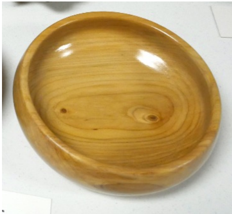
Randy Thorne: bowl of Arizona cypress (left); candle holder of spalted hackberry and bowl of purple-heart cedar (right); and platter of mesquite (below).