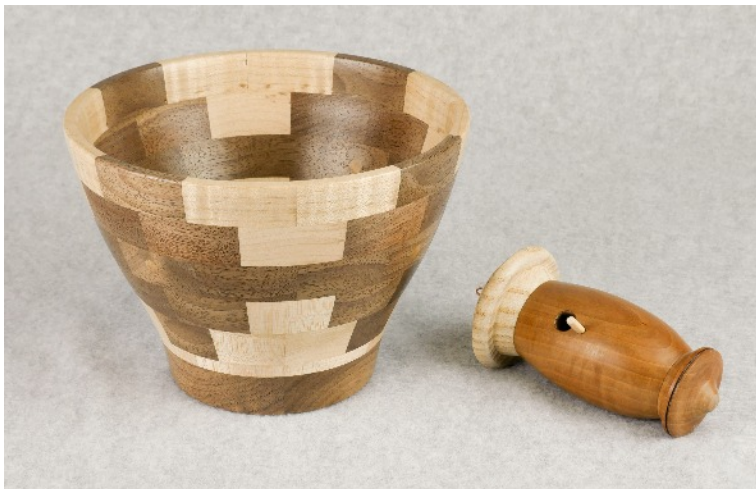
Ron Pedersen: segmented bowl of walnut and maple (4-segment base, 12 segmented layers); birdhouse turned in SPW class, finished at home.