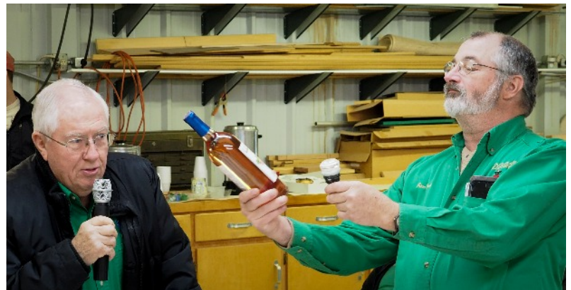
"Better this way or that way? One or two? Left or right? A or B?"