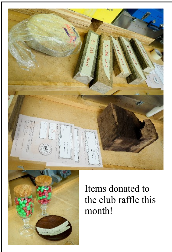
Items donated to the club raffle this month!