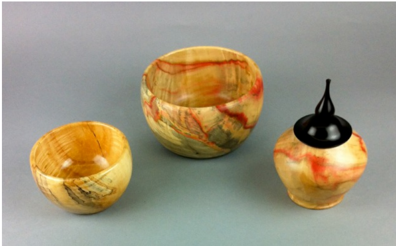
Mike Oglesby shows a bowl of silver maple, completed in November. He also brought a second bowl of box elder and a box of African blackwood and box elder, both also completed in November.