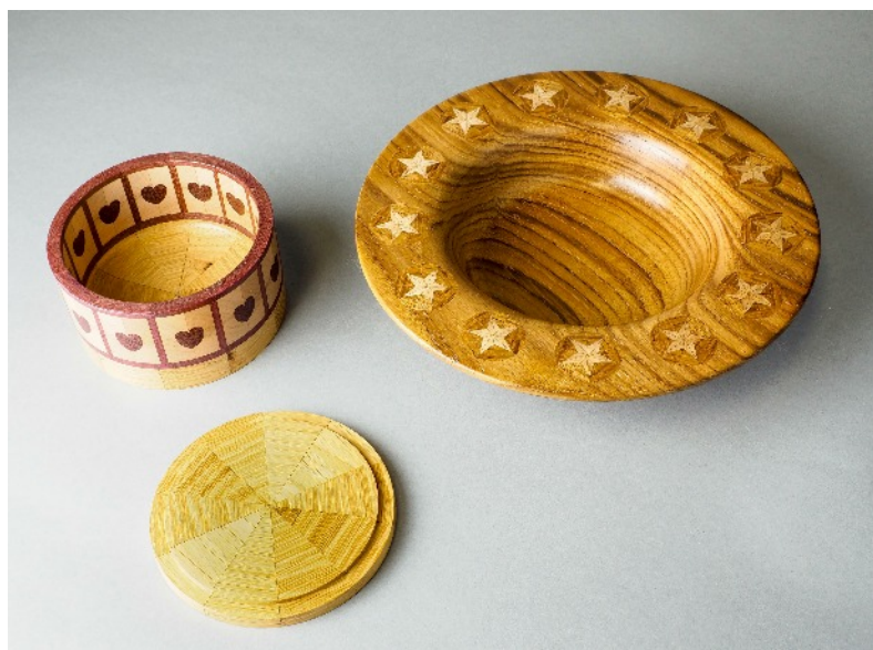
13 Star Platter #2, second prototype, of oak and unknown wood (upper picture).