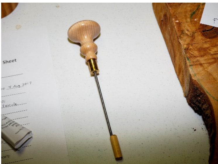
Bob Herman's scratch awl of maple (1/8" drill rod for shaft, .45 pistol case for ferrule).