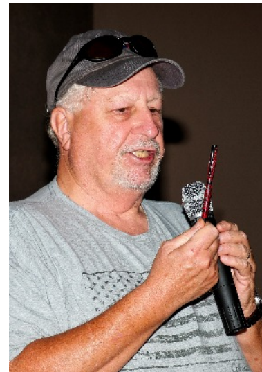
Pens by Bert Lane. "Segment is hard to turn. Spalted tamarind is easy to turn and polish. Thuya burl (with wenge) is easy to turn and beautiful. You need sharp tools for the color grain blanks."