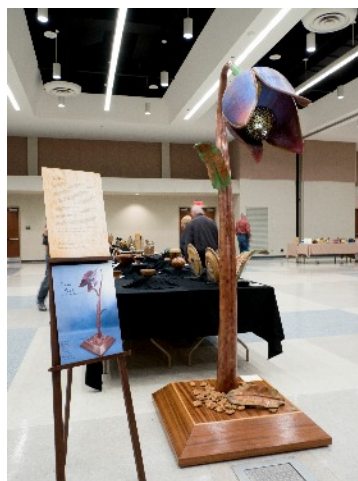
Not from Lubbock!!!