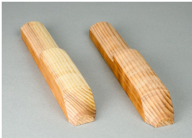
Kent Crowell: 2x4 car/train from redwood. "Comanche Trails club did these years ago for a service project before Christmas."