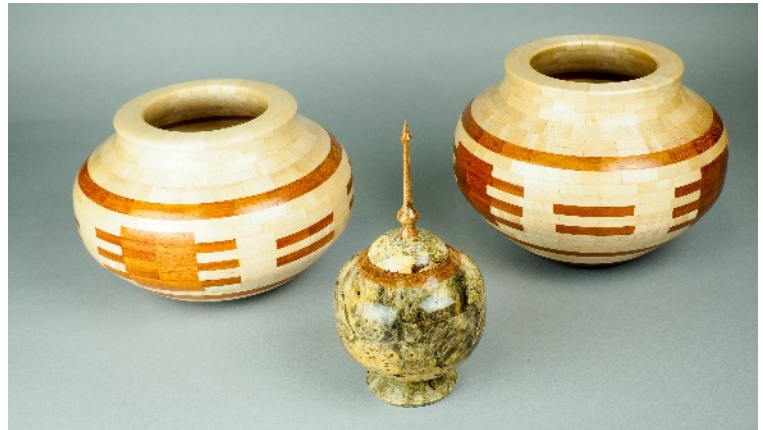
Randy Thorne: segmented bowls of maple, rosewood, and walnut; lidded box of spalted box elder with mesquite lid, ring, and finial; bowl of silver maple. All finished with spray Deft. Randy brought two additional items which are unfortunately not pictured.