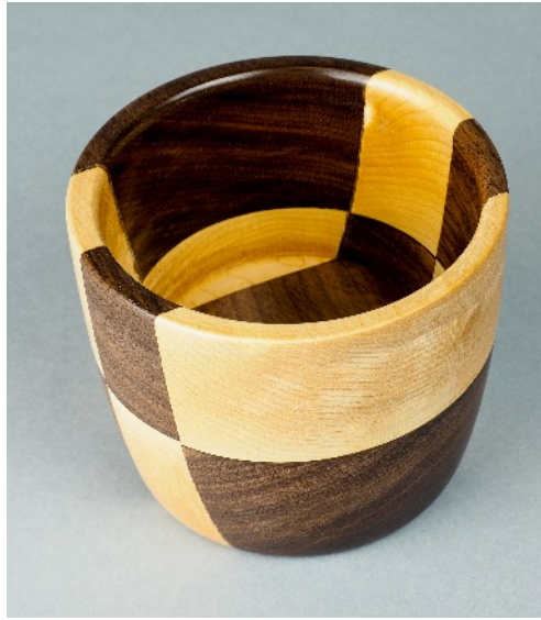
Sonia Comacho: segmented bowl. She also brought vessels which are not pictured.