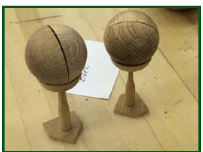
Jim Burt's tribute to baseball. Four hollowed hemispheres set in a cup balanced on two baseball bats. The bats in turn sit on home plates. Play ball! A close examination of the right side reveals a network of pentagrams suggesting a soccer ball.