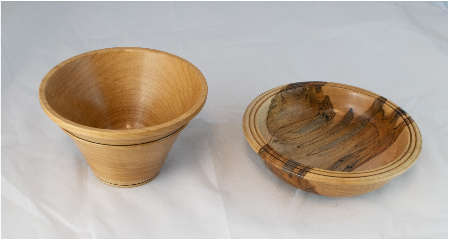
Scot Goen: Top-Mesquite plate and bowl. Bottom- Maple and Ambrosia Maple bowls