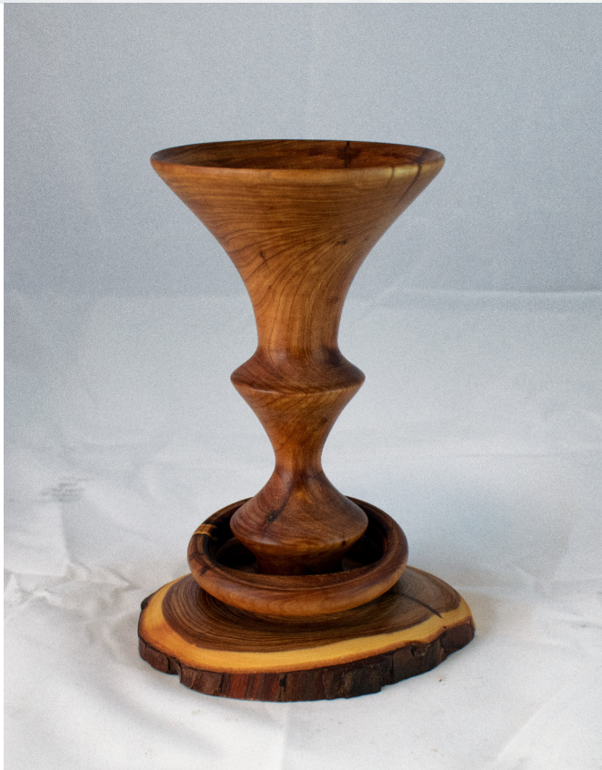
Left: "Chemical Coping" made from Arizona Cypress. Emerging cocktail glass with two captive rings.