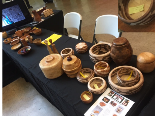
A few members sold their wares at this art sale. Kent said the best sellers were bottle stoppers, seam rippers, small bowls, and ornaments.