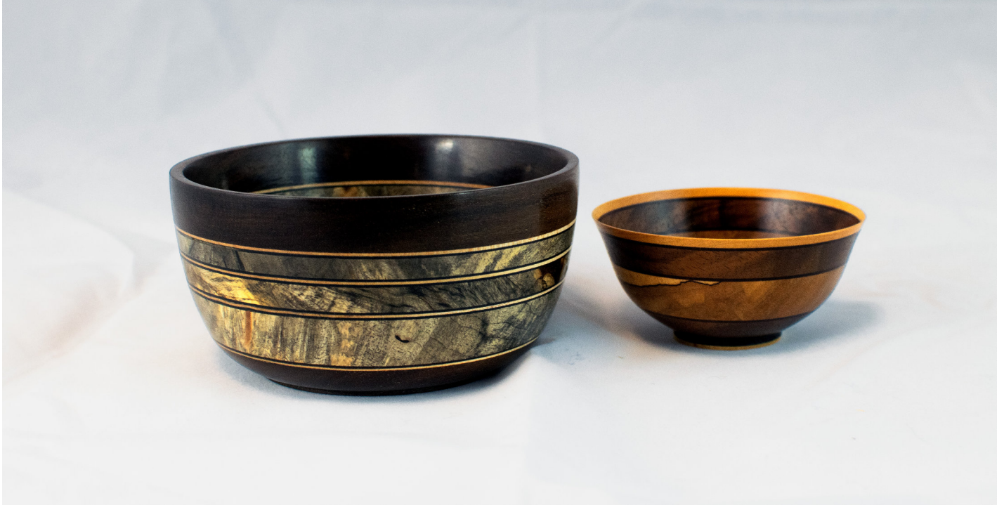
JimBob Burgoon: stacked layer bowls