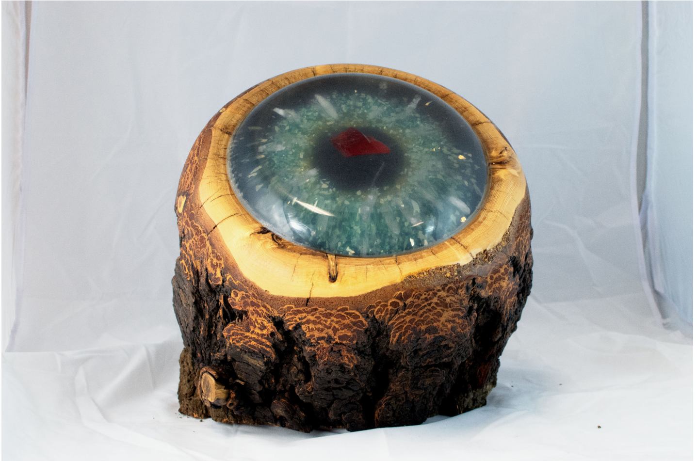
Above: "The Eye of Hypocrisy" made from Douglas Fir. "Why do you notice the speck in your brother's eye, and not the log in your own?" -Matthew 7:3