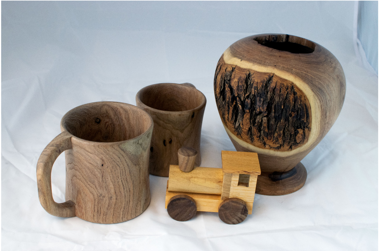
Jim Burt: Mesquite coffee mugs, mesquite vase, and toy engine made from scrap pine, oak, walnut, and poplar.