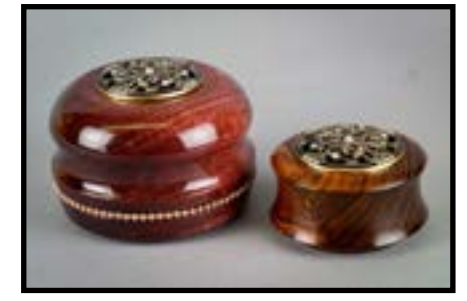
Above are Ed Spence's blood wood (L) and cocobolo potpourri (R) bowls. Ed finished these in October.