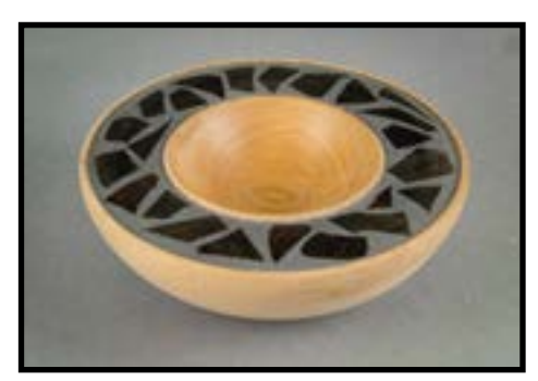
Vicki Oglesby created this during the class at Arrowmont. Vicki's cherry bowl features african blackwood set in <u>West Epoxy</u> System.

Randy Thorne holds one of mesquite crotch form he has recently turned. Randy's big leaf maple burl bowl is seen on page 4.