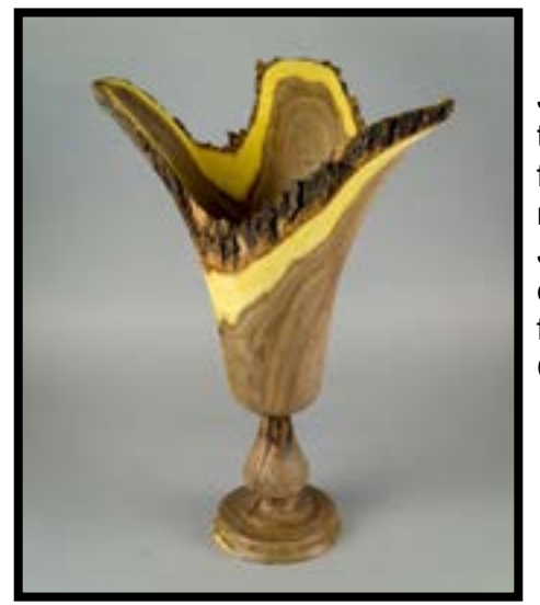
Jim Burt turned this rare threefork natural-edge mesquite vase. Jim filled the occlusions with coffee grounds and CA glue.