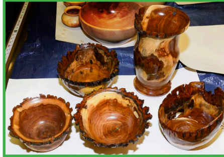
At left David Turner shows a series of natural-edged mesquite bowls and a vase.