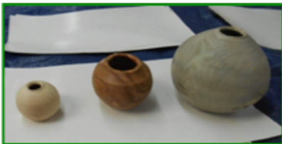
Three hollow-forms exhibited by Miles Kimbell. All are finished with wax.