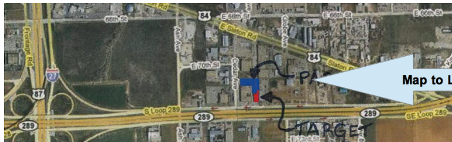
Map to Locate Meetings