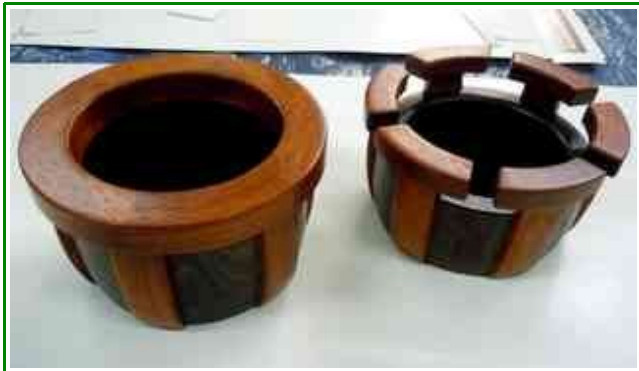
Wenge and Padauk used alternately in two bowls displayed by Dick Markham