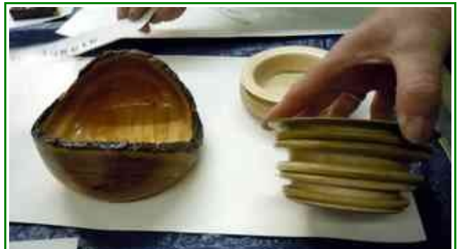
At right above a three ringed bowl turned from poplar. Behind it a one-ringed poplar bowl. David Turner's exhibit is completed with a natural edge locust bowl.