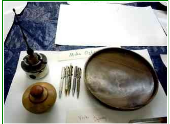
Mike Oglesby displayed the walnut plate at the above right. On the left a sycamore and a bubinga box with lids. All three were completed on February.