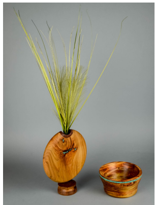
Below Wes Palmer holds twig pot at lower left is Palmer's turquoise enhanced bowl.