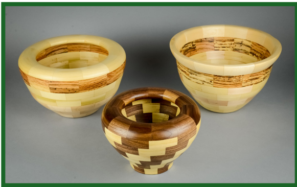
Gordon Graves has been bitten by the segmenting bug. The two bowls combine oak with maple. Gordon's closed form uses walnut and maple.