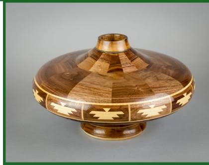
In the image at right Ron Butler holds Thunderbird , a walnut and maple segmented hollow form. Butler's larger vase is constructed from some three hundred-plus pieces of bird's eye maple and padauk.