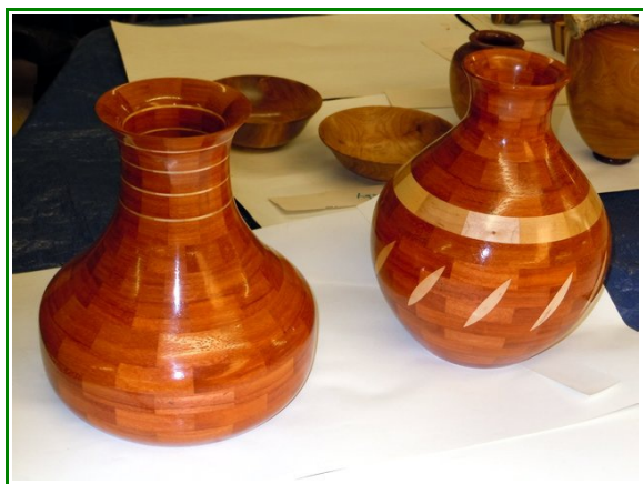
Loy Cornett: Two Vases

Honduras rosewood with maple accents These were turned June. They are finished with clear Deft and buffed.