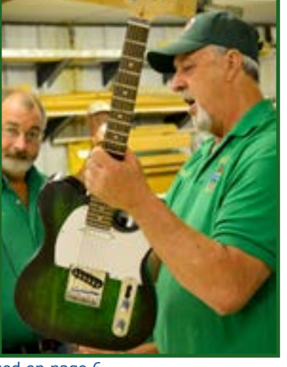
Continued on page 6